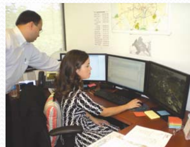
MATOC Staff Monitoring

MATOC SITUATIONAL AWARENESS ALERT: I-95 Northbound, North of Exit 158, Prince William County, VA Multi-Vehicle Accident blocks all travel lanes, traffic is getting by on the left shoulder. Emergency crews are on scene. Delays are approximately 1 mile and growing.