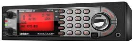
Scanners (Public Safety / Media / Agency/Traffic Spotters)